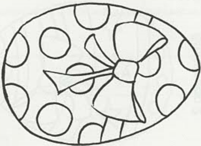
Easter egg 2